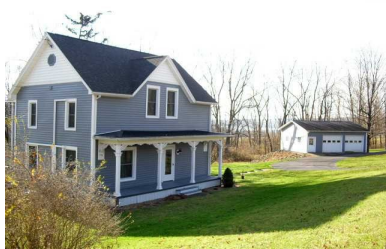
3399 STATE ROUTE 54A PENN YAN, NY 14527